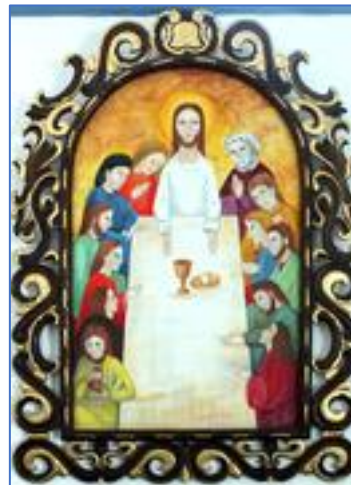
Cathedral of Sancti Spiritus, Cuba

© All Music Used by Permission: CCLI #2028596